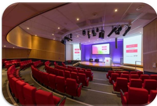
The Kingston Lecture Theatre (venue for the panel discussion)